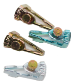
156T1978AMX 1 Set of ON/OFF Trippers for T100, T7000, and WH40