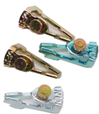
156T1978A Extra/replacement trippers 1 ON and 1 OFF