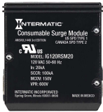
IG120RSM20 Replacement IModule® for IG2280 Series