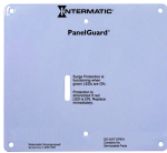
IG3240FMP33 Flush Mount Kit for IG3240RC3